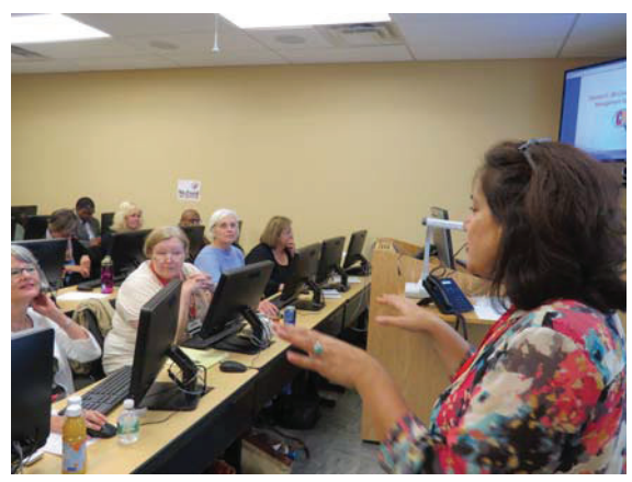
Summer Institute 2014

This year's sessions will be held via videoconferencing and the Rutgers Canvas Learning Platform. You will gain hands-on instruction and practice in using the JBI specialized software program called SUMARI (the System for the Unified Management, Assessment and Review of Information), which is designed to assist researchers and practitioners to conduct systematic reviews of 10 different types, including reviews of effectiveness, qualitative research, economic evaluations, prevalence/incidence, aetiology/risk, mixed methods, umbrella/overviews, text/opinion, diagnostic test accuracy and scoping reviews. More information on this comprehensive tool is available at jbisumari.org